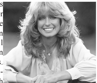
A Fallen Angel.

Farrah Fawcett was born on February 2, 1947 and died in June 25, 2009. She is most remembered for her unique hairstyle that made her an international sex symbol in the 1970's and 80's. Farrah was diagnosed with cancer in 2006 and began chemotherapy. On her 60th birthday she was diagnosed cancer free but four months later she was told she had another polyp. Fawcett died in Saint John's Health Center in Santa Monica.